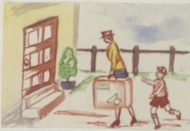
Stanley (aged 40) changing billets:- "I'll carry my bag now, Miss."

Children from London and other cities were evacuated to Dorset villages in order to keep them safe from air raids, leaving their families behind to stay with strangers.